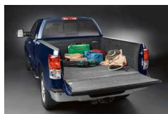
Bed Rug Long Bed $419 Parts Only MSRP** Regular Bed $434 Parts Only MSRP**