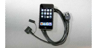
Interface Kit for iPod® $299 Installed MSRP*