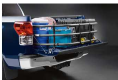
Bed Extender $320 Installed MSRP*