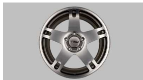
TRD 22"x9" 5-Spoke Polished Forged Aluminum Alloy Wheel $4,699 Installed MSRP*