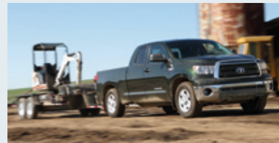
4x2 Double Cab standard bed shown in Spruce Mica with available 5.7L V8, tow package, fog lamps, mudguards and 18-inch styled steel wheels [14].