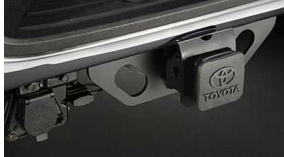
Tow Hitch w/ 7 Pin Connector $920 Installed MSRP*