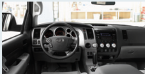
Double Cab Tundra interior shown in Graphite.