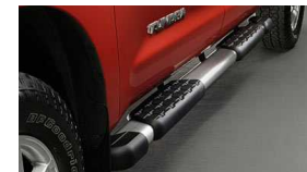
Stepboards Brushed Stainless Steel $624 Installed MSRP*