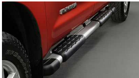
TRD 17" x 8" 6 Split Spoke Forged Off-road Wheel w/ Beadlock Styling $624 Installed MSRP*