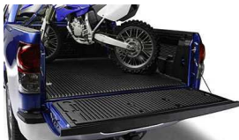
Bedliner w/o Deck Rail System Long Bed $375 Installed MSRP* Regular Bed $345 Installed MSRP*