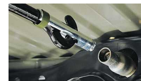
Spare Tire Lock $73 Installed MSRP*