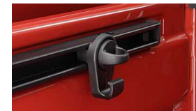
Mini Tie Down w/Hook (set of 2) $45 Installed MSRP*