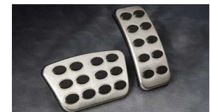
Sport Pedal Stainless Steel $85 Installed MSRP*