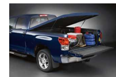
Tonneau Cover $1,575 Installed MSRP*