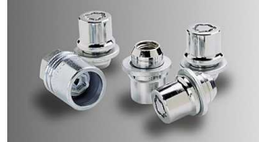
Wheel Locks $81 Installed MSRP*