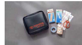
First Aid Kit $29 Installed MSRP*