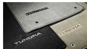
Carpet Floor Mats $115 Installed MSRP*