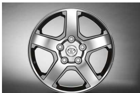
20" Machined Star 5 Spoke Wheel $1,585 Installed MSRP*