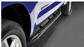
Tube Steps - Black $490 Installed MSRP*