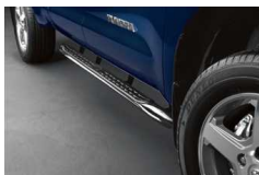
Tube Steps - Chrome $534 Installed MSRP*