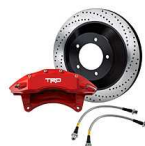
TRD High Performance Brake Kit $2,895 Installed MSRP*