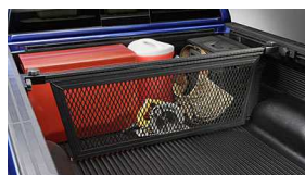
Cargo Divider $345 Installed MSRP*