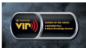
VIP-RS3000 Plus Security System $299 Installed MSRP*