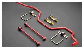
TRD Rear Sway Bar $299 Installed MSRP*