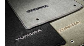
Carpet Floor Mats w/Door Sill Protector $178 Installed MSRP*