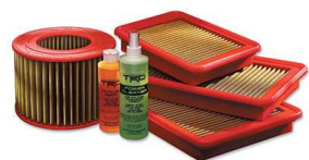
TRD Performance Air Filter $90 Installed MSRP*