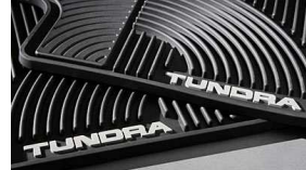
All Weather Floor Mats w/ Door Sill Protector $162 Installed MSRP*