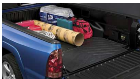
Bed Mat Long Bed $137 Installed MSRP* Regular Bed $137 Installed MSRP*