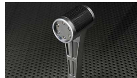
Anodized Aluminum Shift Knob $85 Installed MSRP*