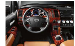
Molded Simulated Burlwood Dash Applique by Superior Dash $350 Installed MSRP*