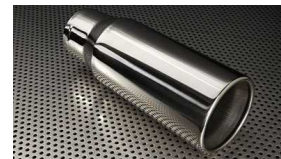
Exhaust Tip $85 Installed MSRP*