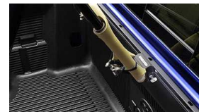
Locking Bike Fork Attachment $95 Installed MSRP*