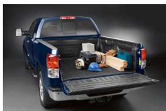
Bedliner w/Deck Rail System Long Bed $395 Installed MSRP* Regular Bed $365 Installed MSRP*