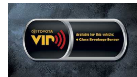
Glass Breakage Sensor (GBS) $165 Installed MSRP*