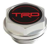
TRD Forged Oil Cap $45 Parts Only MSRP**