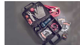
Emergency Assistance Kit $70 Installed MSRP*