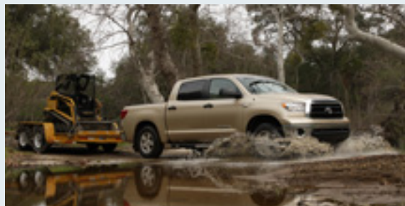
4x4 Crewmax Tundra shown in Sandy Beach Metallic with available 4.6L V8, fog lamps and 18-inch alloy wheels.