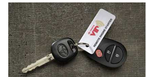
Remote Engine Start $529 Installed MSRP*