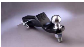
Ball Mounts $65 Parts Only MSRP**