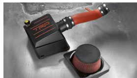
TRD Performance Air Intake $475 Parts Only MSRP**