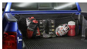
Cargo Net Exterior $49 Installed MSRP*