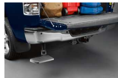
Bed Step $300 Installed MSRP*