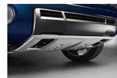
Front Skid Plate $425 Installed MSRP*