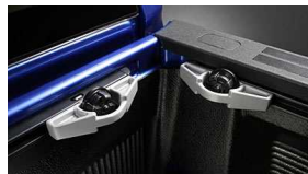
Deck Rail System w/4 Tie Down Cleats Long Bed $220 Installed MSRP* Regular Bed $210 Installed MSRP*