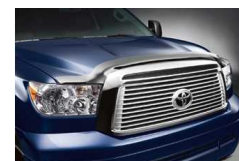
Hood Protector $165 Installed MSRP*