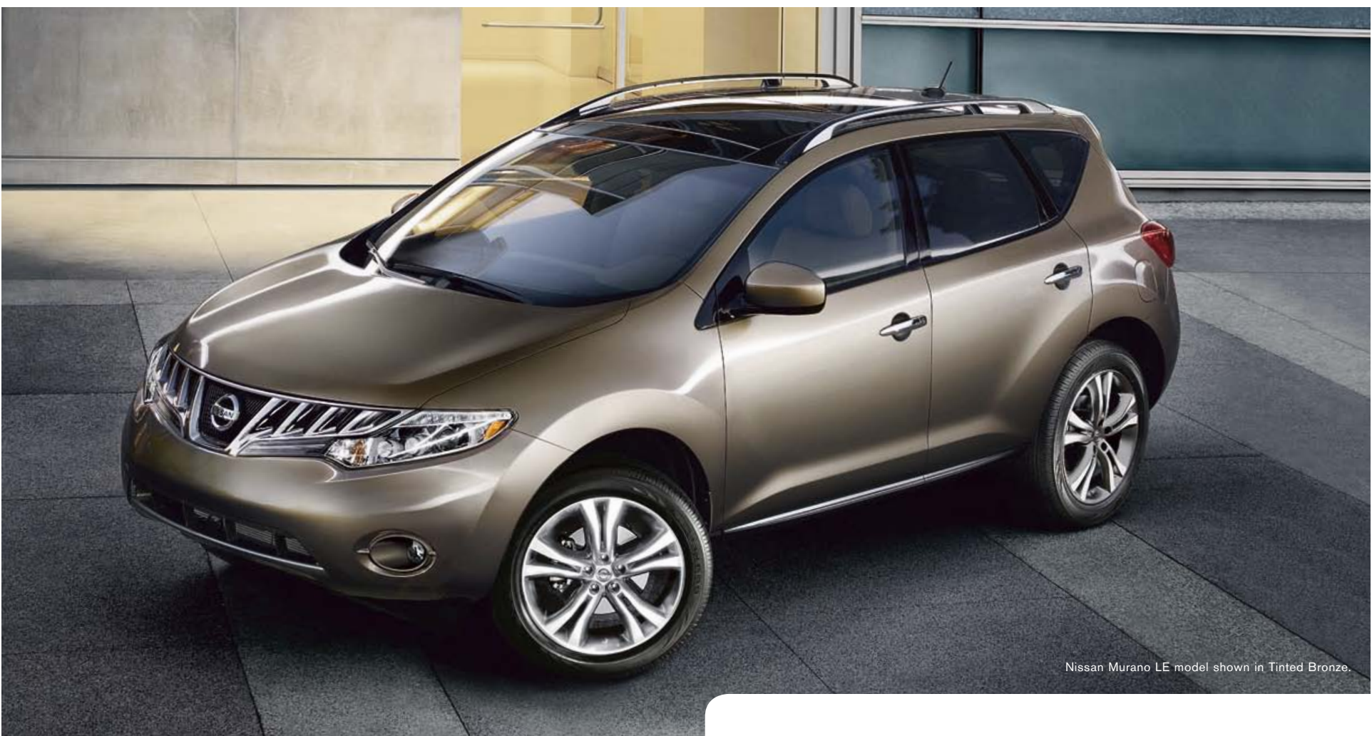
PRINTED EXCLUSIVELY FOR