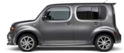
KRÖM™: NOW THIS IS EDGY.