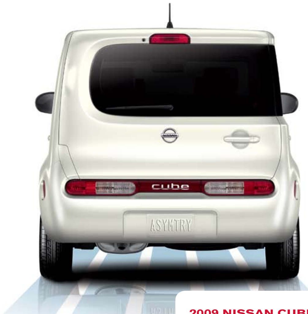
cube® 1.8 SL in Pearl White.