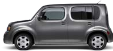
1.8 S: ADD IN EXTRA AMENITIES.