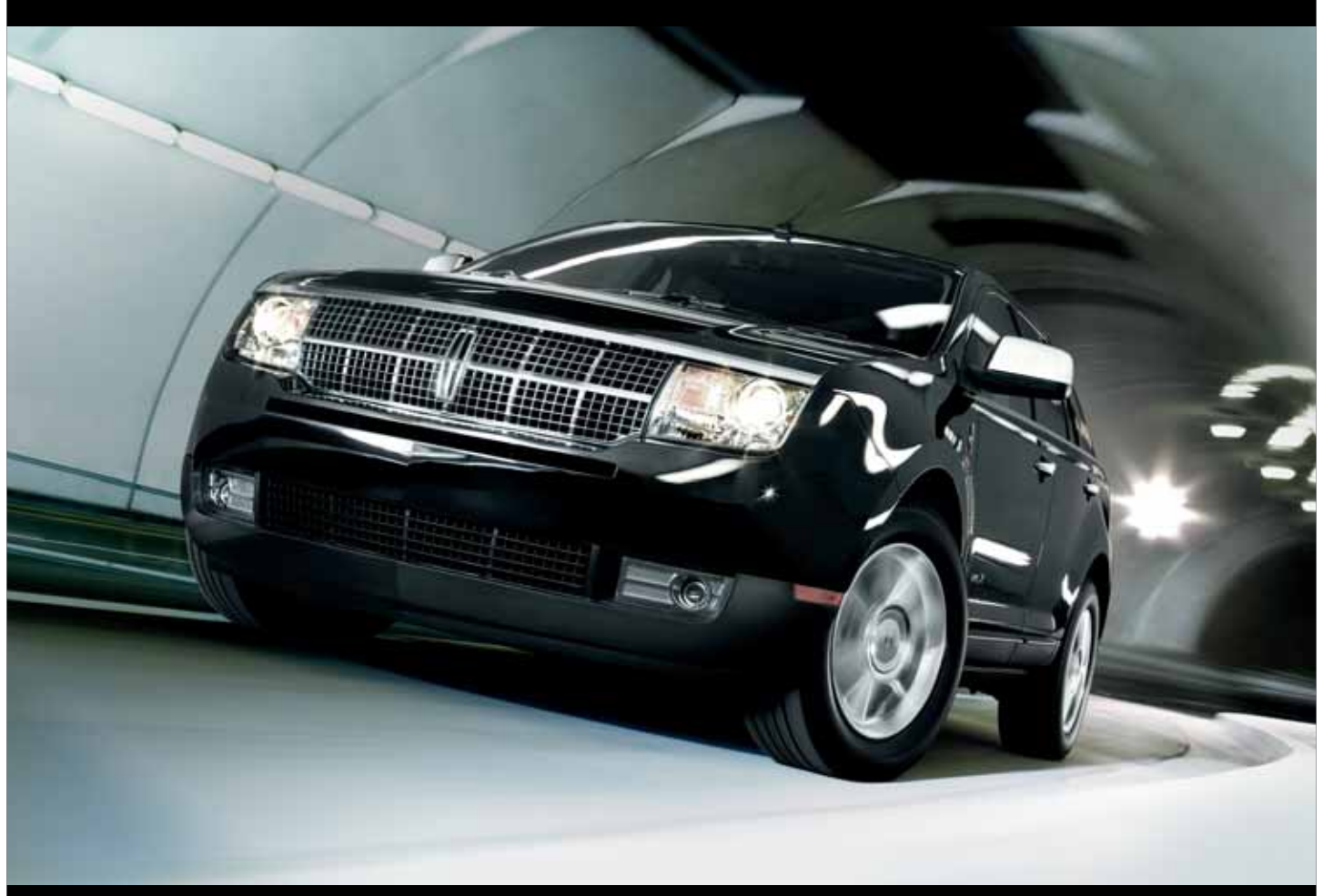
Lincoln MKX in Tuxedo Black Metallic with available equipment.